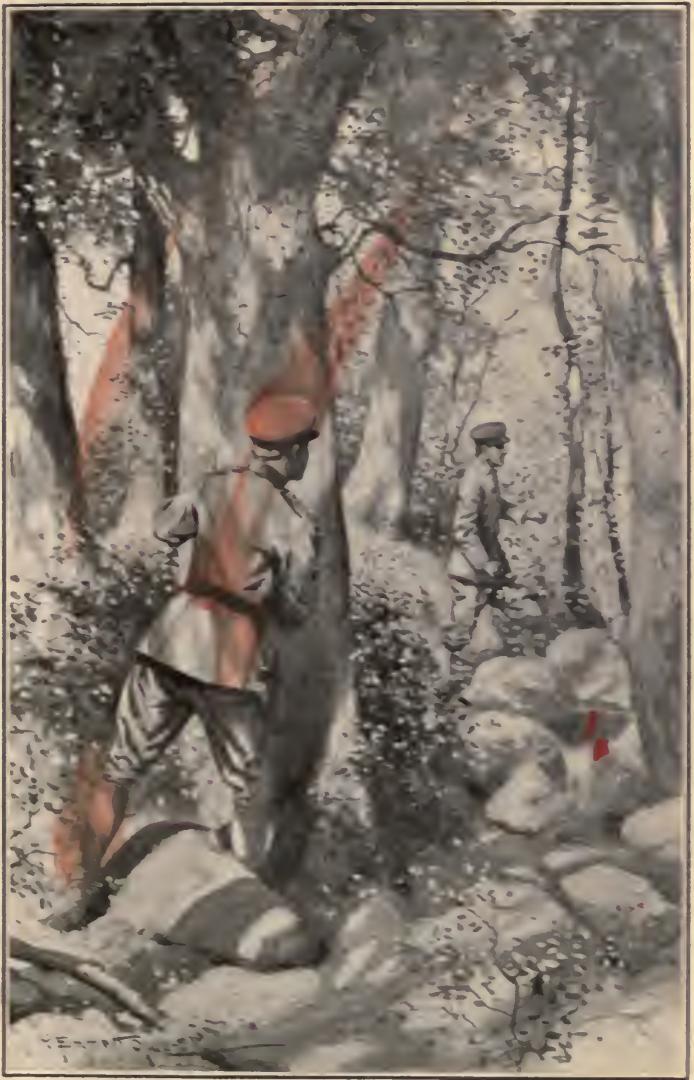
TOM SLIPPED BEHIND A TREE AND WATCHED THE MAN WHO PAUSED LIKE A STARTLED ANIMAL. Page 57